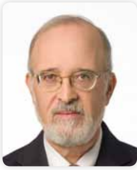
Prof. Major-General (Res.) Isaac Ben-Israel